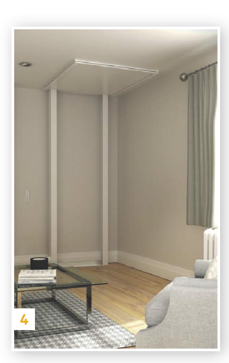
The lift moves to the other floor and vacates the space it was in. The guides are set back against the wall and do not impact on the room.