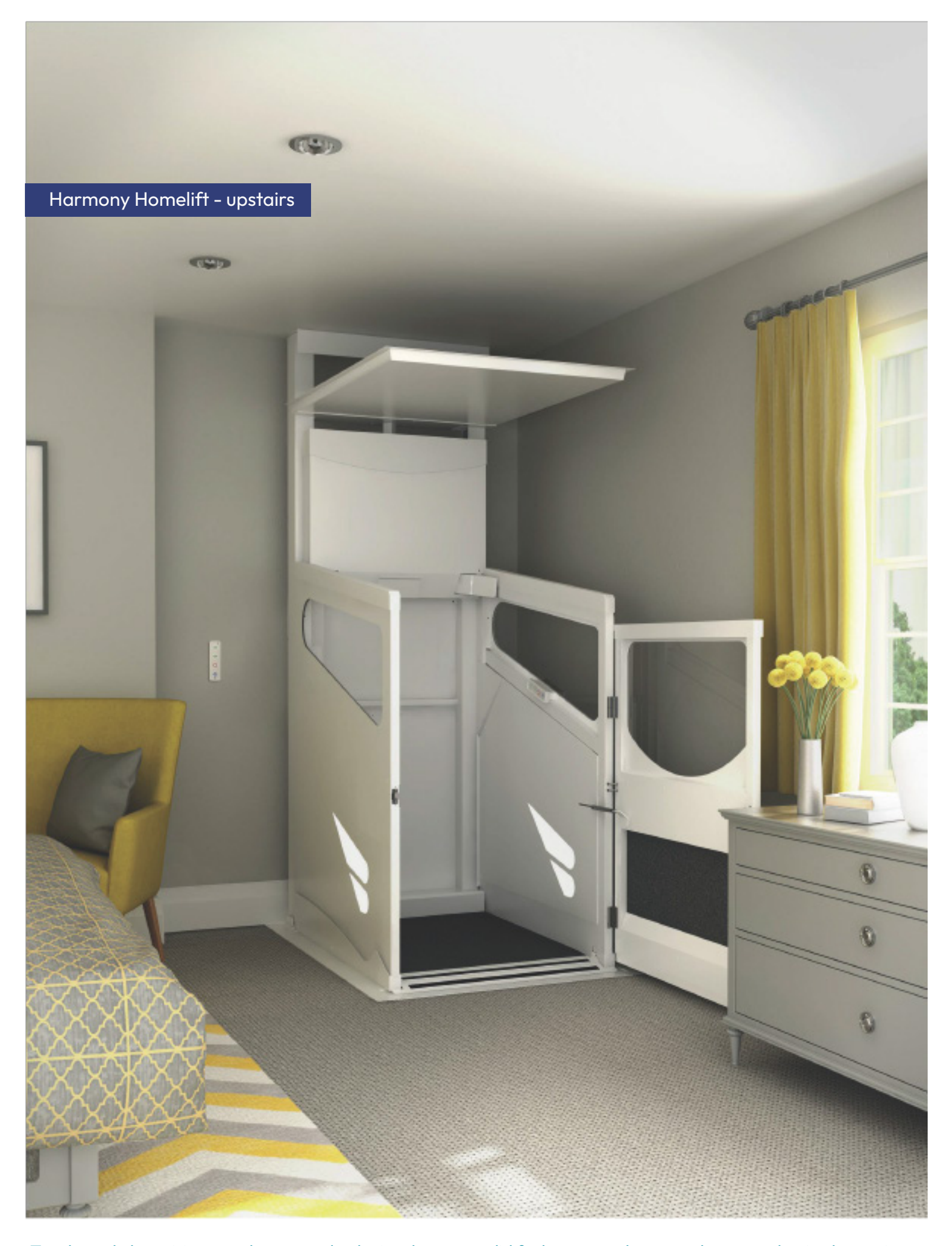
Toughened glass vision panels, as standard, give the car a solid feel compared to scratch-prone plastic alternatives