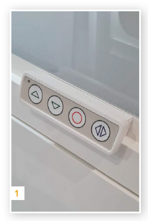
Easy-to-use wireless controls come as standard in the cabin and at both floors.