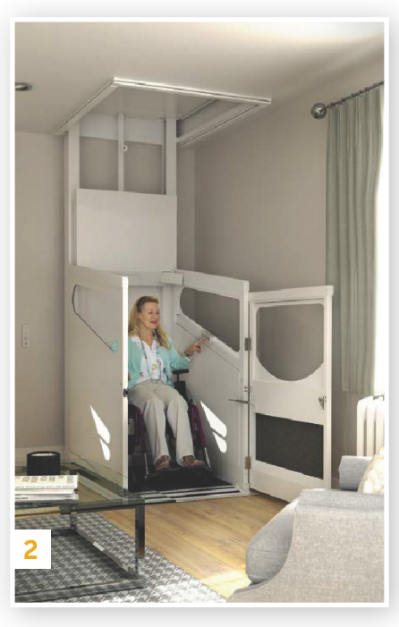
A simple push of the button sends the lift up. The controls can be positioned to suit your needs.