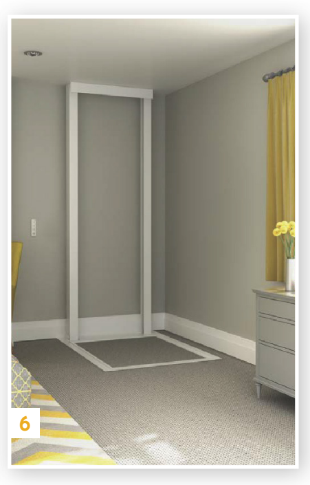
The lift can be sent back to the floor below, leaving a feeling of space in the room.