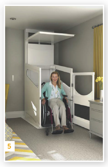
Low cabin floor construction ensures easy wheelchair access and egress.