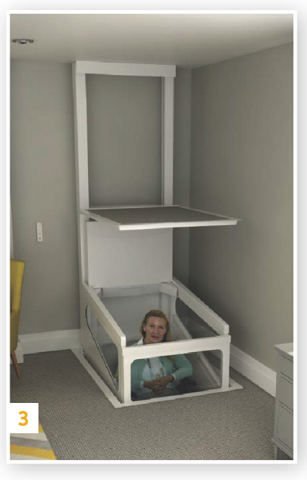
The aperture ceiling panel is automatically lifted or replaced en-route.